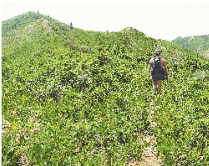
A hiker approaches Dale Peak (left) between Parleys and Emigration Canyons.